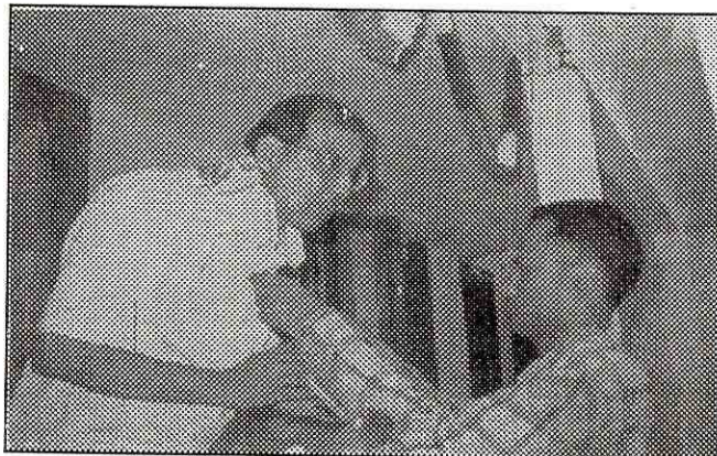
A view of the Fresher's Social at Boys' Hostel.

Situated at the foothills of the Nilachal Hills, the college was established on August 9, 1971, and launched with the generous financial help of the donor, after whom the college is named, to cater to the students of the city's periphery.